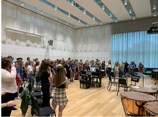
All-State Honors Choir rehearsal