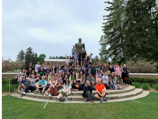
All-State Honors Choir